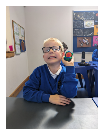
Our Science focus this term is on the layers of the earth, including different types of rocks. All pupils made their own play-dough models of our planet.